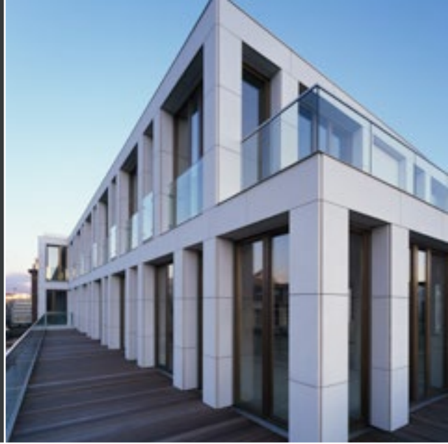
Bornhold House | Hamburg